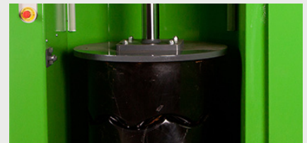
Integrated drum piercing