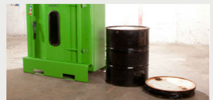
Crush drums to a fraction of their size