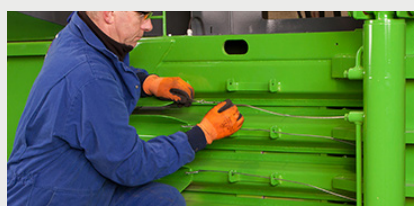
4-wire easy-tie system ensures bales stay compacted