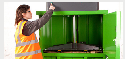
Best compaction ratio means more material in each bale, reducing machine run time