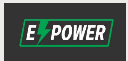
LSM e-Power for added time, energy and cost savings