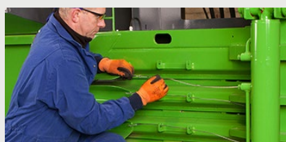
4-wire easy-tie system ensures bales stay compacted