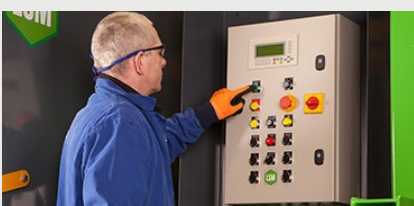
Automatic cycle with anti-jam programme