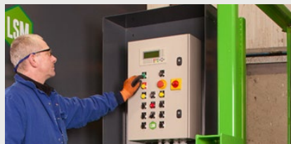
Semiautomatic guillotine-style discharge allows for full ejection of bale